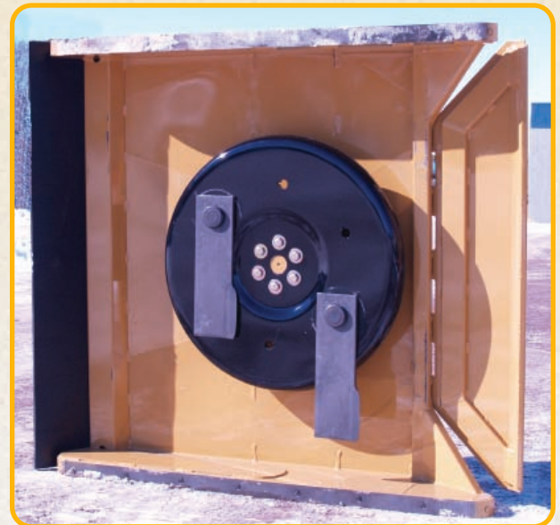
BENGAL TRB-50H (Assembled with Brush Knives)